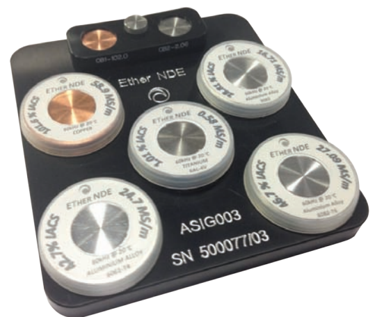
Conductivity Test Blocks In Holder

ETher NDE also manufacture individual conductivity test blocks which may be used to match the clients own testing requirements. We can also provide a handy test block holder (Part number: ASIG003) that can hold up to five of these test blocks at any one time as shown above.