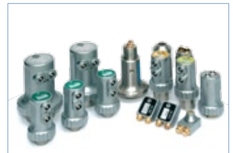
Support of large selection of probes