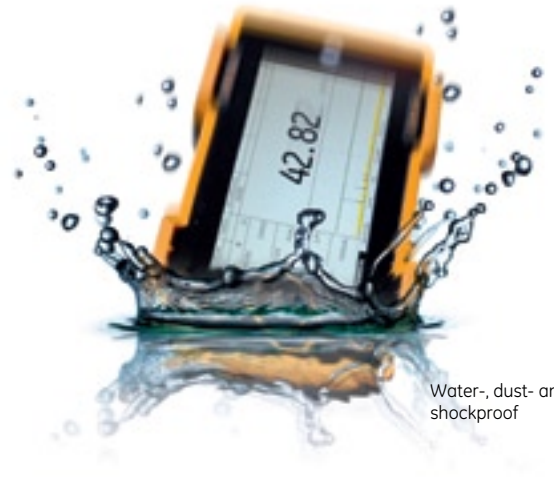
Water-, dust- and shockproof