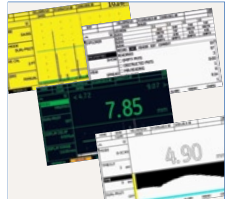
Views to suite everyone: large A-Scan, Data Recorder, thickness, B-Scan.

The DMS Go from GE's Inspection Technologies business is a high-end thickness gauge which combines an innovative, easy-to-use user interface, powerful data management and an ability to provide accurate, reliable and comprehensive thickness inspection data. It is ideally suited for a wide range of applications including measuring for corrosion in the oil and gas sector and in power generation.