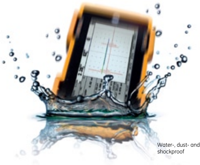
Water-, dust- and shockproof